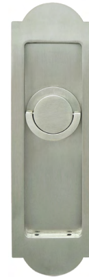
FH3192 Flush Pull w/ TT09 Thumbturn