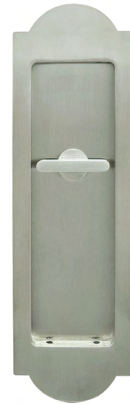
FH3182 Flush Pull w/ TT08 Thumbturn