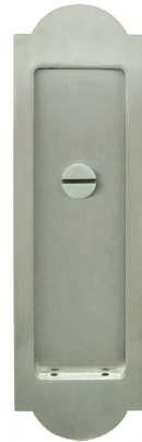
FH3104 Flush Pull w/ Thumbturn Release