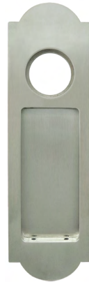
FH3103 Flush Pull w/ Cylinder Hole